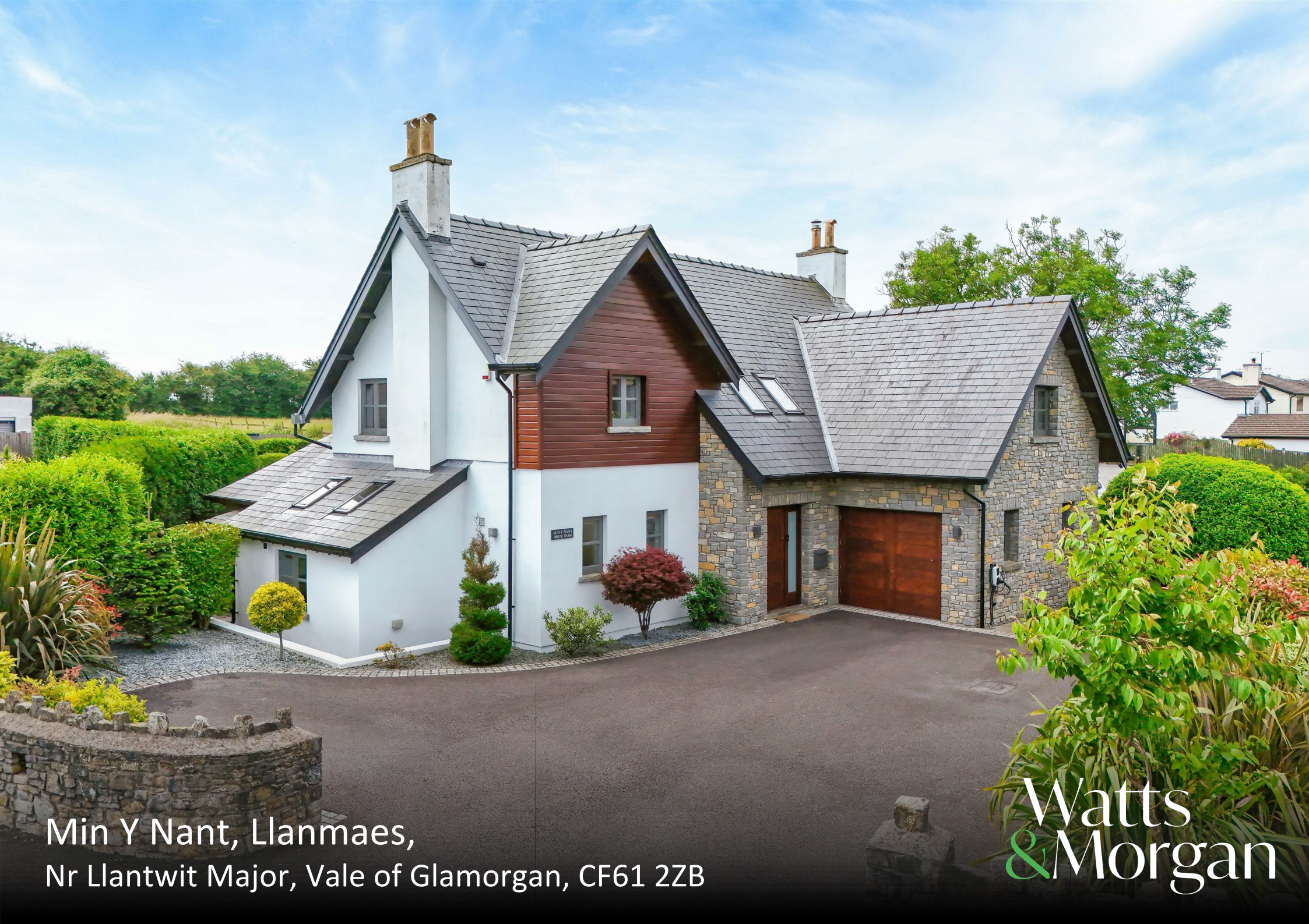
Min Y Nant, Llanmaes, Nr Llantwit Major, Vale of Glamorgan, CF61 2ZB